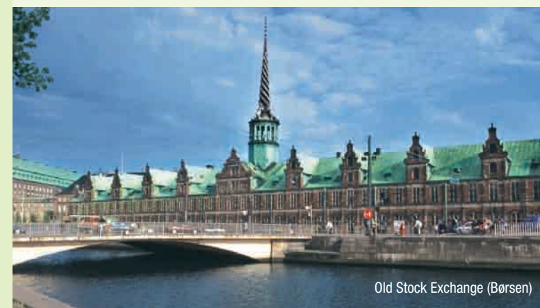
Old Stock Exchange (Børsen)